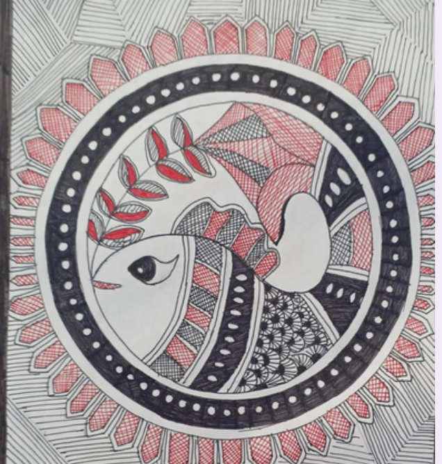
Satwika Grade 6