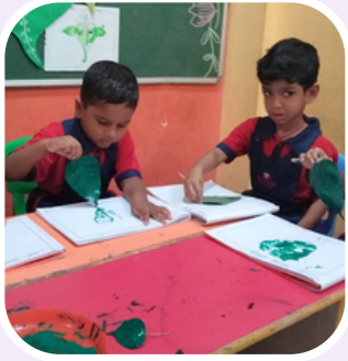
Leaf Printing Activity